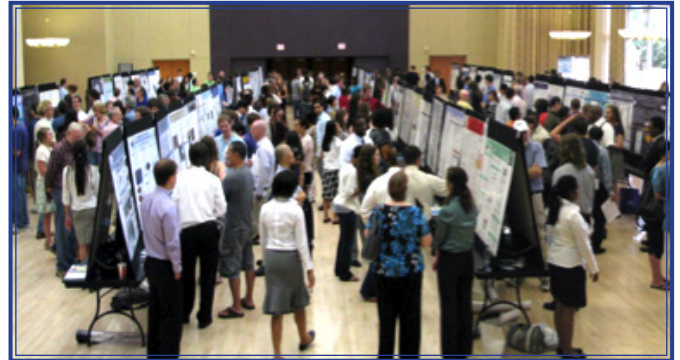
STUDENTS PRESENTING AT THE SUMMER INBRE SYMPOSIUM.

Understanding the molecular mechanisms that underlie cardiovascular pathophysiology will help to find new ways to combat cardiovascular disease. (LSU Health Sciences Center - New Orleans)