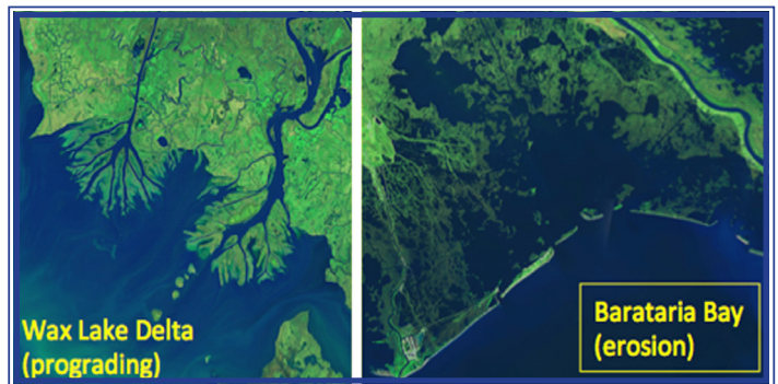
MISSISSIPPI RIVER DELTA PLAIN SHOWING REGIONAL STUDY SITES: LEFT: WAX LAKE DELTA (GROWING); RIGHT: BARATARIA BAY (ACUTE LAND LOSS).

Researchers are investigating the transport of carbon through the land-sea interface by examining two contrasting Mississippi River Delta sites.