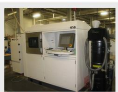
The University of Louisville (UofL) has one of the world's premier additive manufacturing groups.

UofL is a member of AmericaMakes and partners with leading AM users such as: