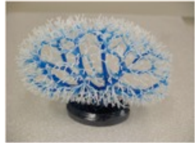
Kidney vascular tree made of plastic using rapid-prototyping techniques